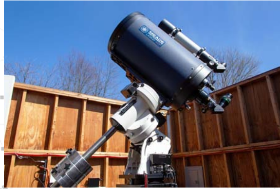
The Meade 16" Schmidt-Cassegrain Telescope.

The heart of the observatory are our new 16" Schmidt-Cassegrain and 4" refracting telescopes, both mounted on an ultra-stable Astro-Physics 1600GTO German equatorial mount. The mount is computer-controlled, permitting quick, automatic access to thousands of stars, star clusters, nebulae, and galaxies. The observatory is open during every Public Observing Session.